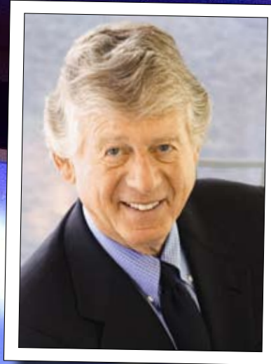
Keynote speaker Ted Koppel Historic television reporter and 26-year host of ABC's Nightline