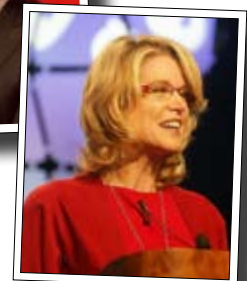
Paula Zahn, 2010